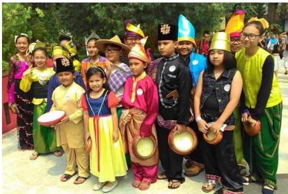
School Activity Booth by Yumin Primary School