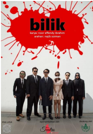
Bilik , by TEATRO, Temasek Polytechnic